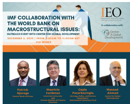
Outreach event for the evaluation of IMF Collaboration with the World Bank on Macro-Structural Issues.

In discussing the report, Executive Directors emphasized the importance of ensuring effective collaboration as the Fund increasingly engages on a broad range of policy issues including those related to fostering a robust global economic recovery from the pandemic, and joined the Managing Director in broadly supporting the recommendations. Many Directors underscored that work on climate issues would be a strong candidate to develop a more tailored collaboration framework between the Fund and the Bank. Many Directors supported creating a high-level joint Fund-Bank committee to focus on longer-term strategic issues and help institutionalize collaboration. IMF management will work with staff to propose a follow-up implementation plan in coming months.